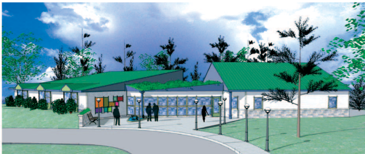
- View of front entry